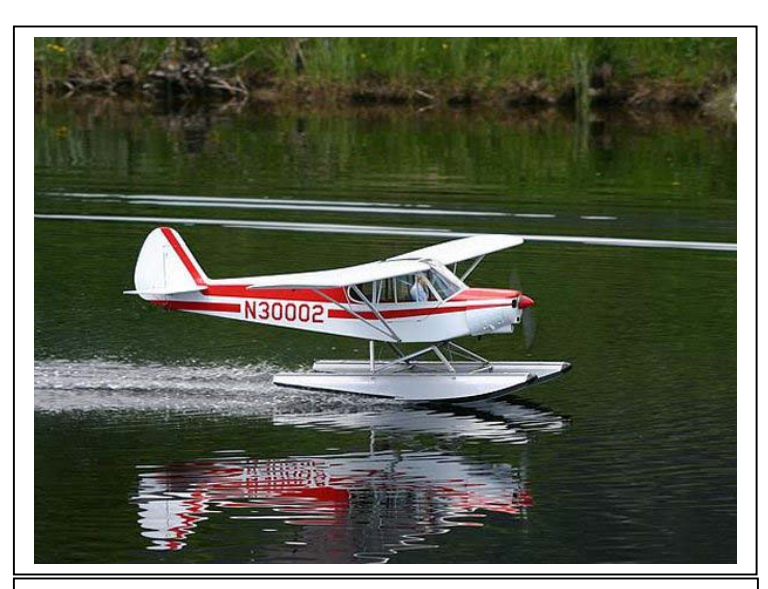
It's Float Fly Time again. See upcoming events.