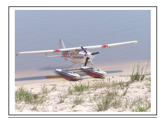
Float Fly May 13<sup>th</sup>-Lake Surovec