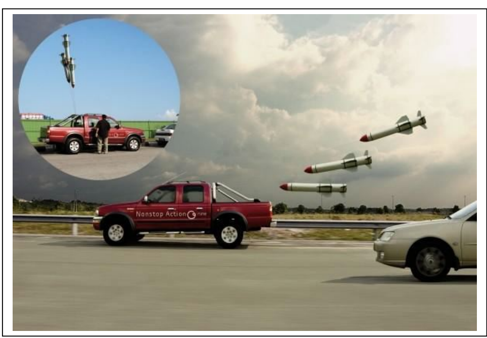
Wouldn't this be a Hoot!!!