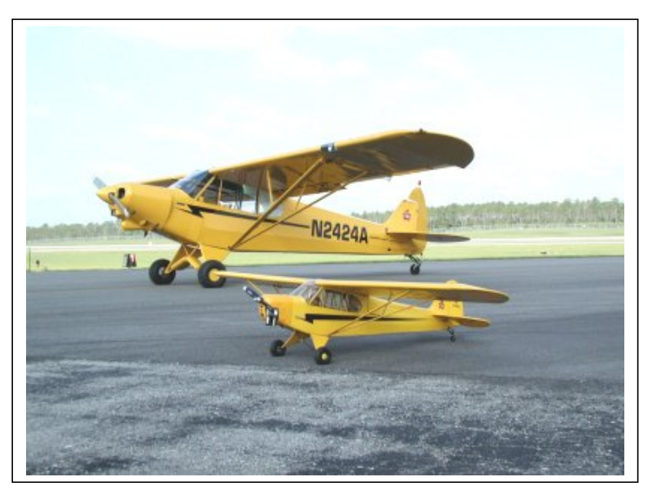
Airfest 2006- Where Full size meets Miniature. A gathering of bird lovers.