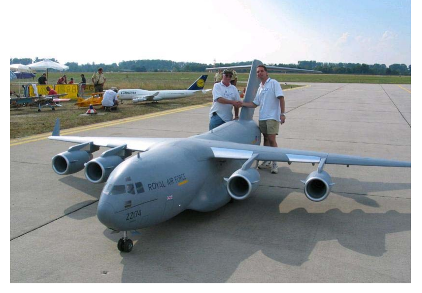
Flying this monster C-17 must be a thrill. See page 6.