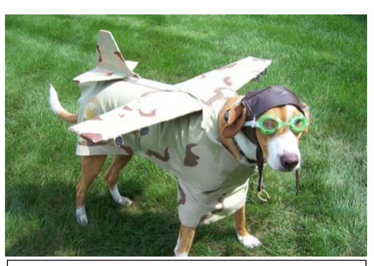
No Mike, we're not going to put a motor on him.