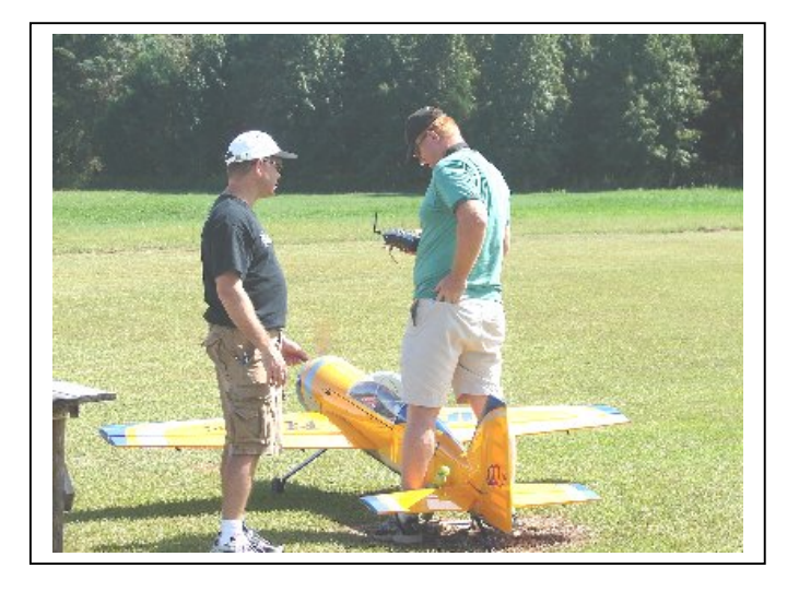
Photo Gallery- Fall Fly In October 11, 2008