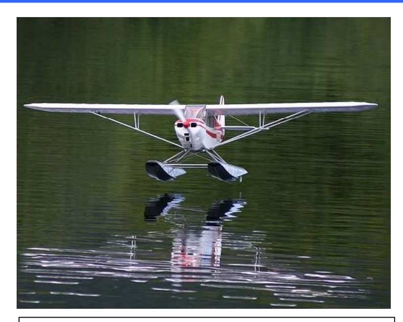
Float Fly- December 9, 2006 Lake Surovec