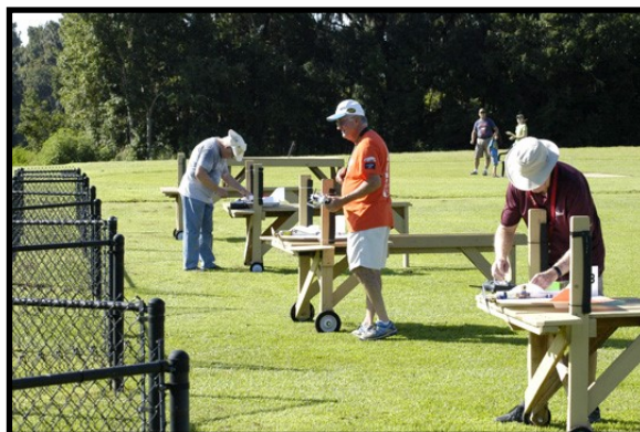
Excitement growing in the pits