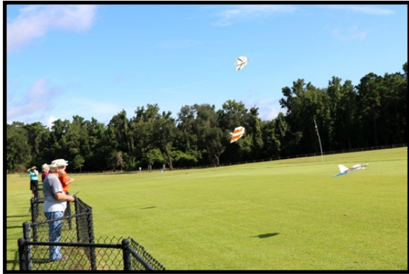
The next heat