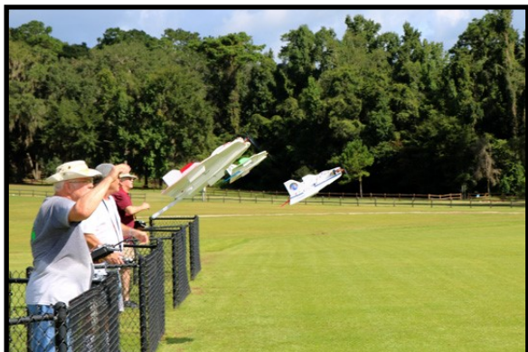
And, they're off! The third round of pancake races.