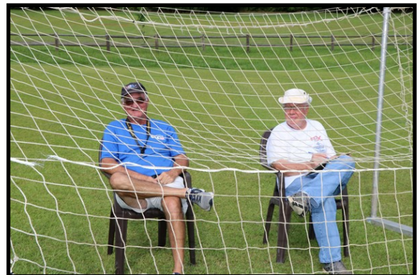
Judges — or — We finally caught 'em