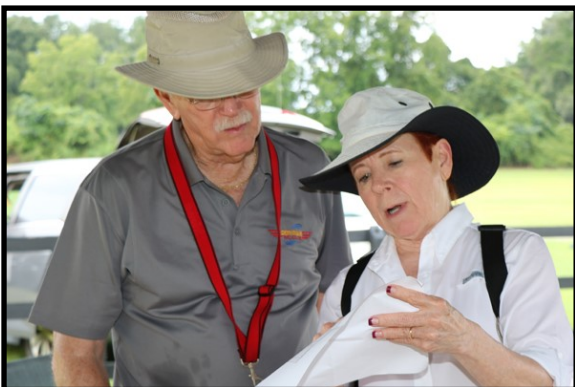
Checking the scores