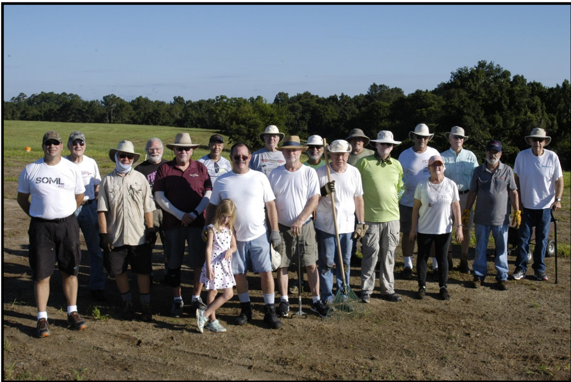
The Rock Band

Chicago may have Lollapaloosa , Nevada may have Burning Man , but we have real rocks and the hottest venue around. Yes, it was hot and sweaty. A sincere thank you to the 32 club members who banded together to pick up debris on our new runway.