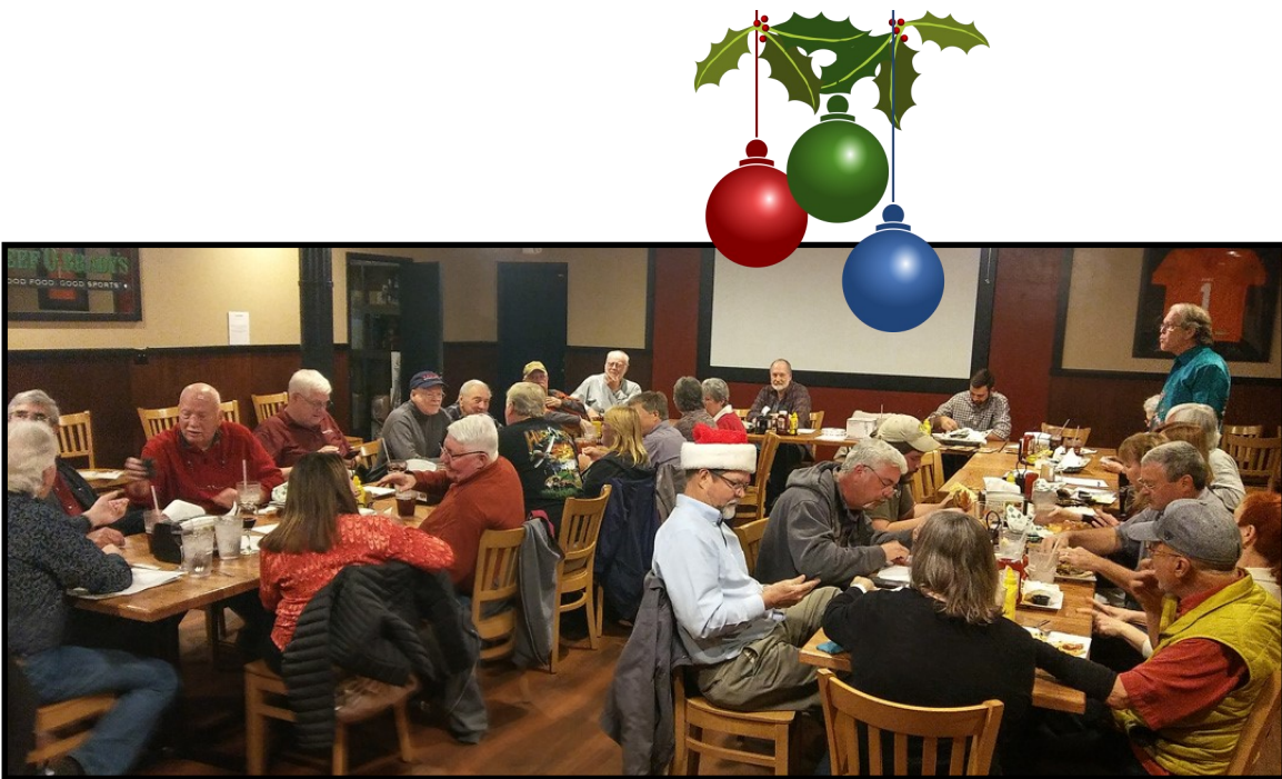
Members and guests enjoyed the 2016 club meeting and Christmas party.

The business portion of the meeting was adjourned at 7:50 PM. More discussion and merriment ensued.