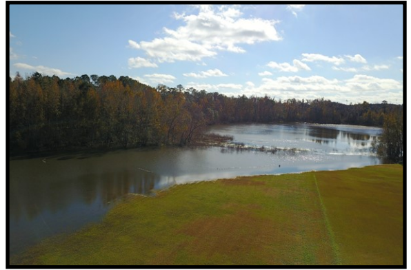
Our new floatplane runway