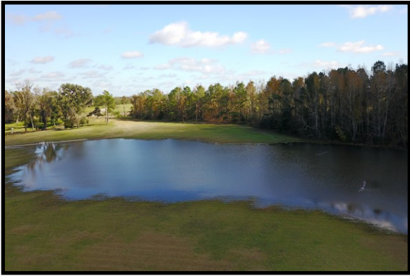
Our new floatplane runway