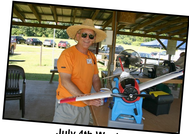
July 4th Weekend