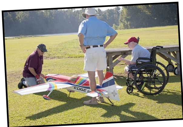
Believe in a Cure

Around the Field is a monthly collection of member items and activities. Feel free to email photos and comments for publication to SeminoleRadioControlClub@gmail.com