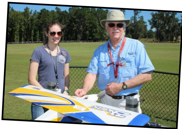
Believe in a Cure