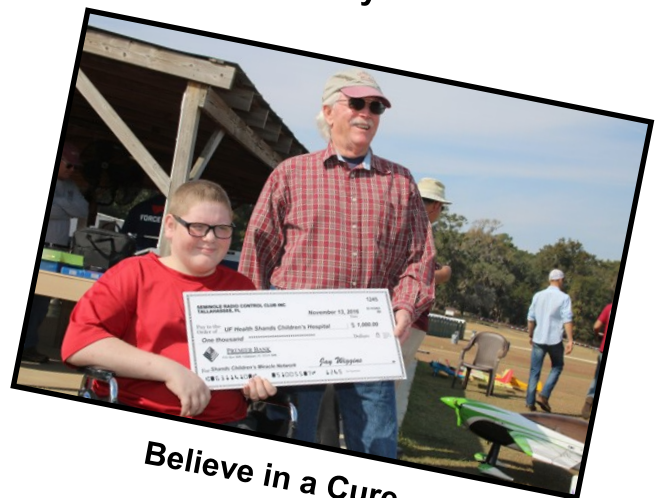
Believe in a Cure