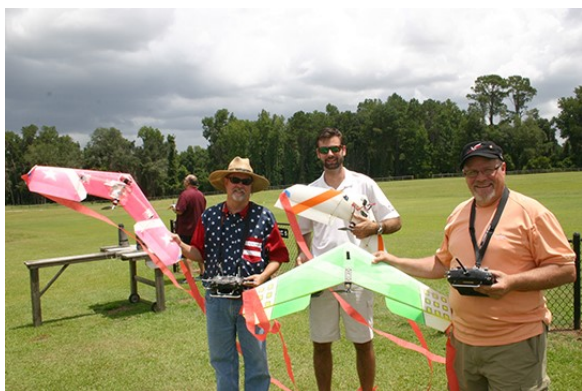
Ready for battle!