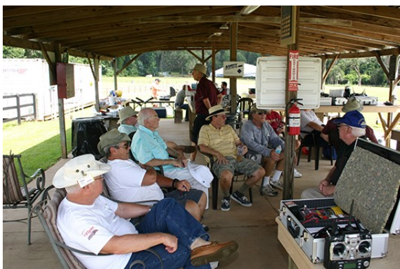
Not too many folks out in the sun