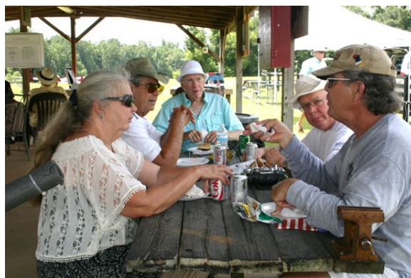
Friendly conversation over lunch