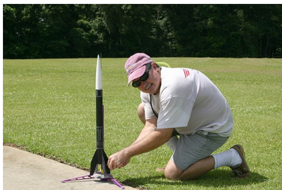
The rocket's red glare . . . Almost