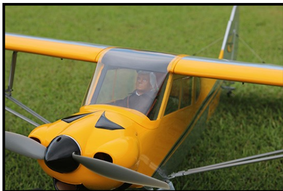
Ready for take-off