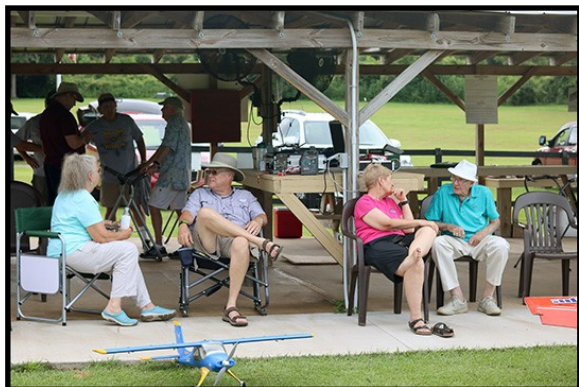
Enjoying the evening