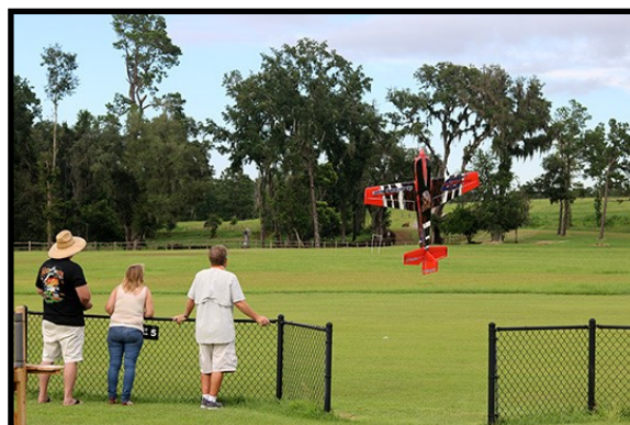
How low can he go?