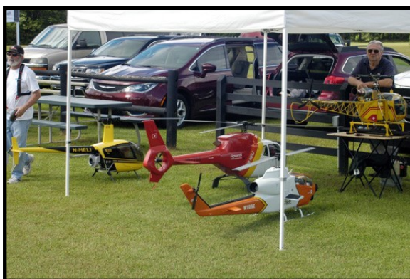
Beautiful scale helis