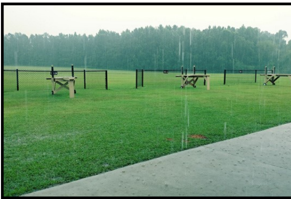
Then came the rain