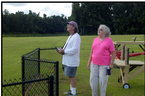
Our chief pilot and co-pilot