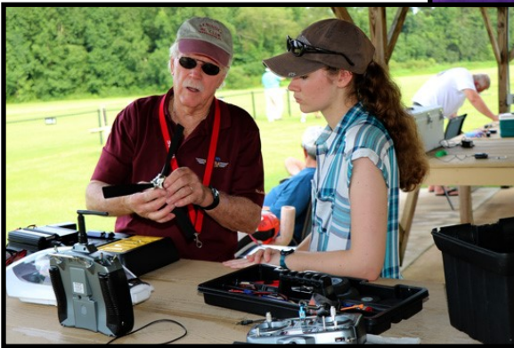
A few preflight adjustments