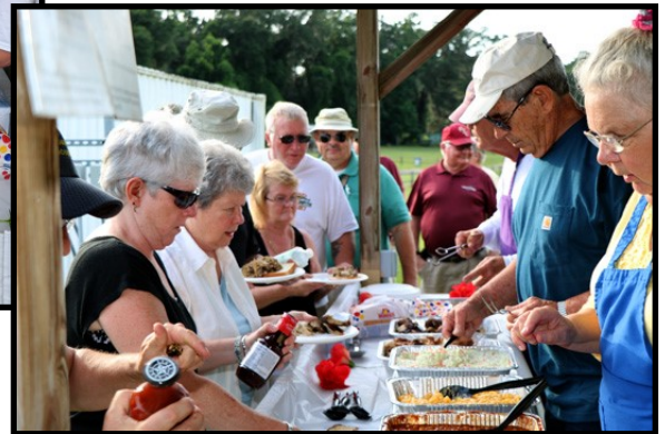
What a meal!