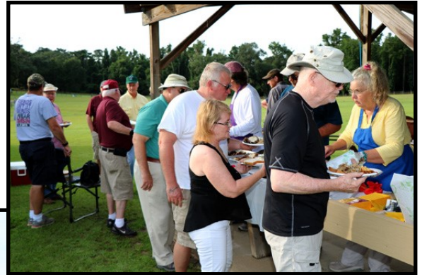
No hesitation lining up