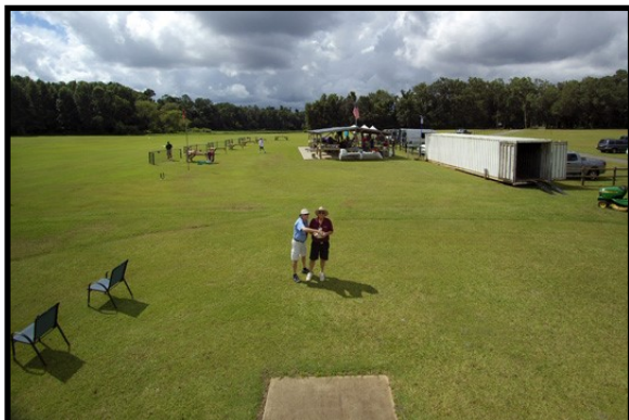
Drone's eye view of Geoff coaching Jeff