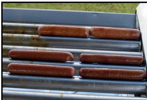
Hot dogs! Yum!!