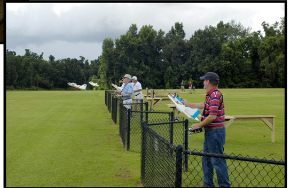
And, they're off! The second round of pancake races.