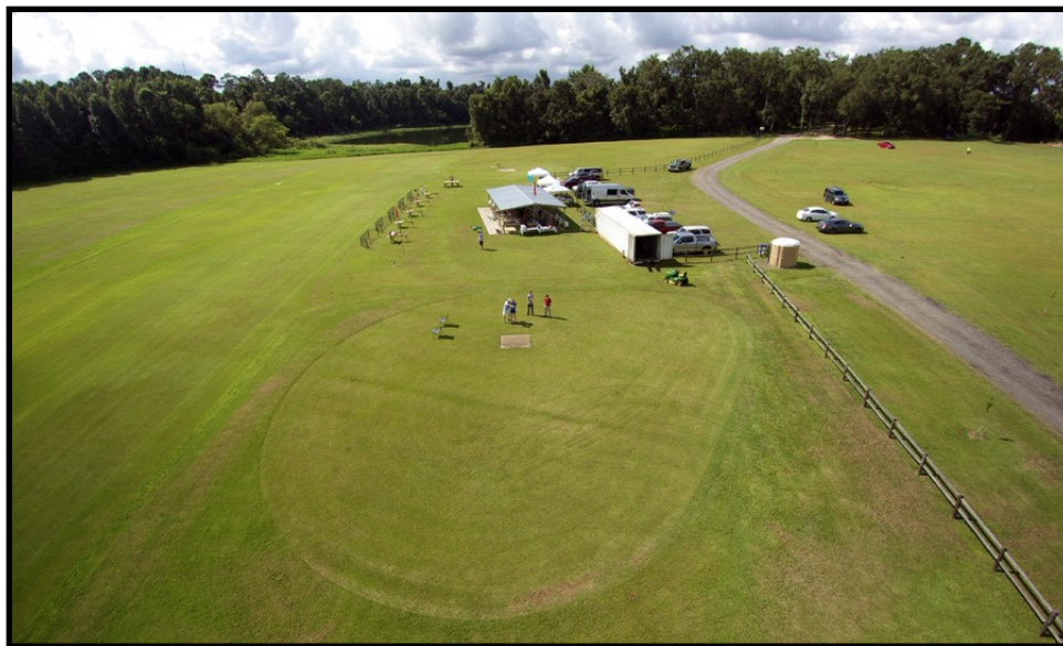
Early morning drone view

Our club continues to have a very active summer. Last month it was our memorial Day Weekend War Bird Fly-In, the Sheriff's Office Family Day and first of our Pancake Race series. This month it was the Independence Day weekend Fire Cracker Fly-In, the second of our Pancake Race series and the annual President's Barbecue and Night Fly.