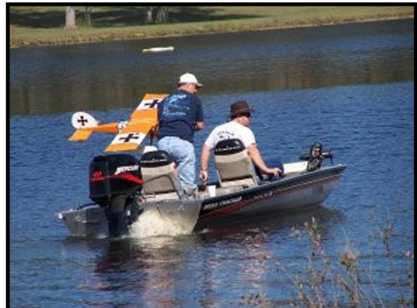
2005 Float Plane Fly-In