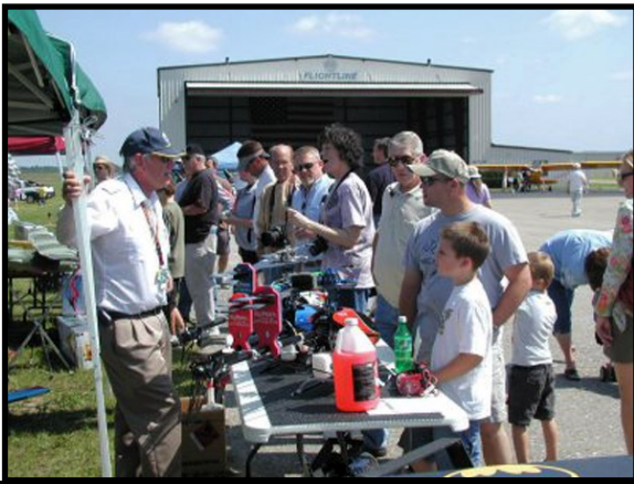
2006 Airfest at TLH

Members participated in several demo flights and displays at schools, social functions and community events each year to encourage interest in our hobby and our club. The club rented a booth at the North Florida Fair in 2004 in partnership with HobbyTown USA with an exhibit featuring our club .