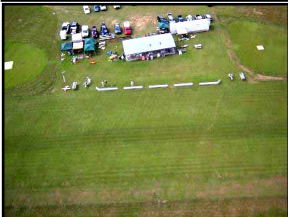
Field aerial in 2008 by Geoff