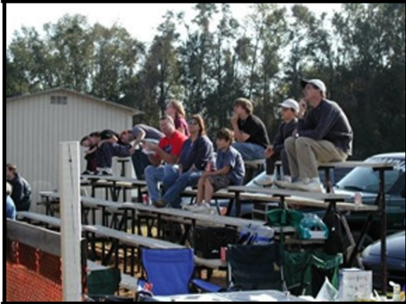
Spectators at 2005 Fall Fun-Fly