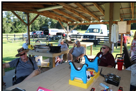
Relaxing during a beautiful afternoon