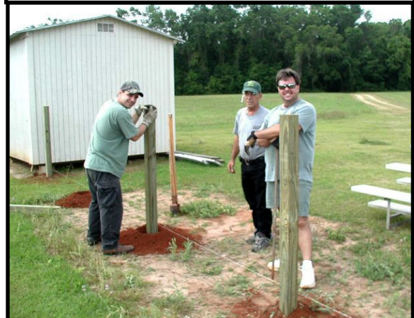
Putting in a fence in 2008