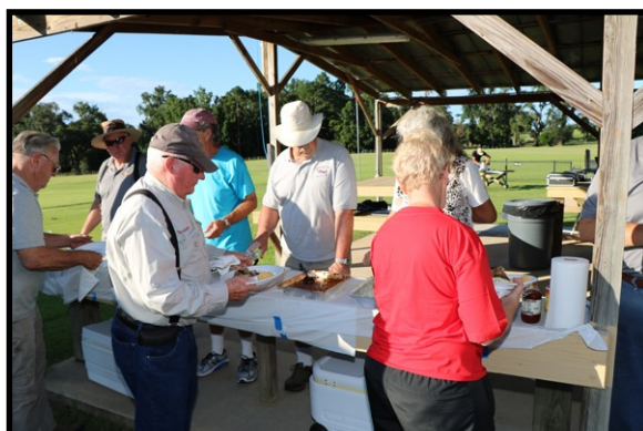
Everyone got their fill