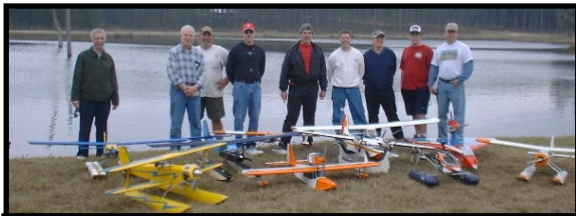
January 2005 Float Fly