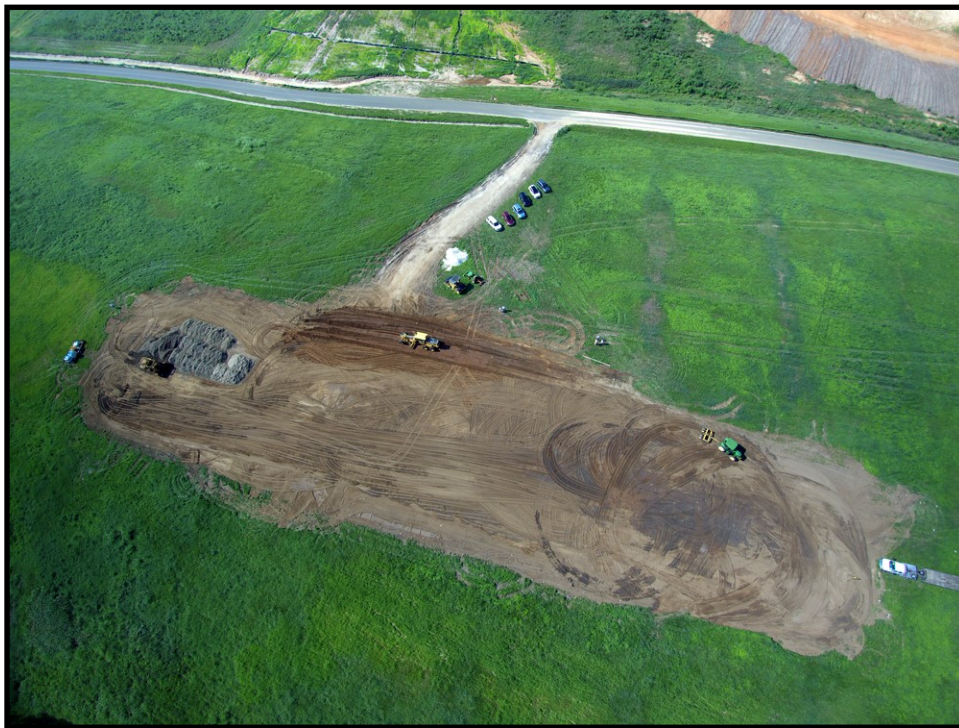
Topsoil is spread on our new runway . . .

Our new runway needs your help! Saturday, August 3, we will have a "work day" to pick up the rocks and sticks on the runway. Actually the "day" will only be from 8 AM to 10 AM. Wear outdoor shoes, bring a pail or bucket, and gloves if you wish. Rich is providing buckets and pickup sticks for those who want to use them. Drinks will be provided. This is