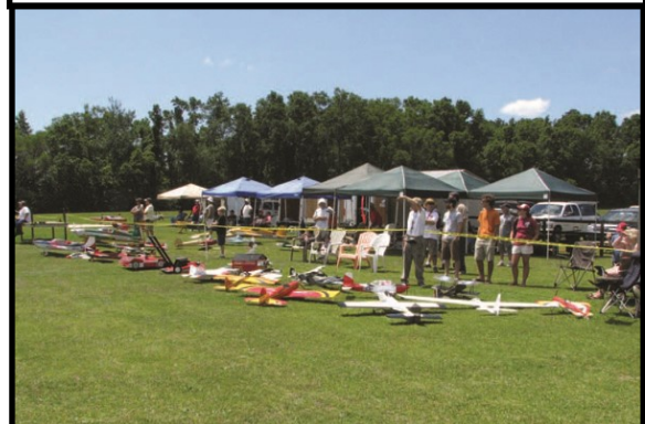
2009 Flying for a Cure