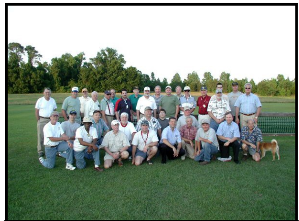
2006 Flying for a Cure