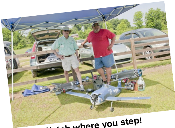
Watch where you step!