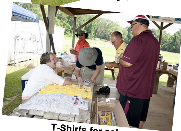
T-Shirts for sale