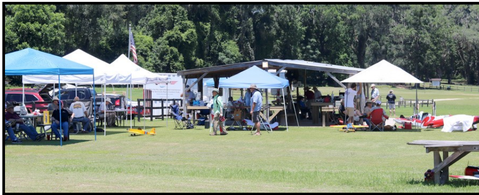
May 2017 Memorial Day Weekend Fly-In

Club activities just keep coming. There are two new events scheduled on the heels of our recent glow engine clinic and our Memorial Day Fly-In. The first is the July Firecracker Fly-In on July 1 st and the second is our annual Club BBQ Meeting at the Field.