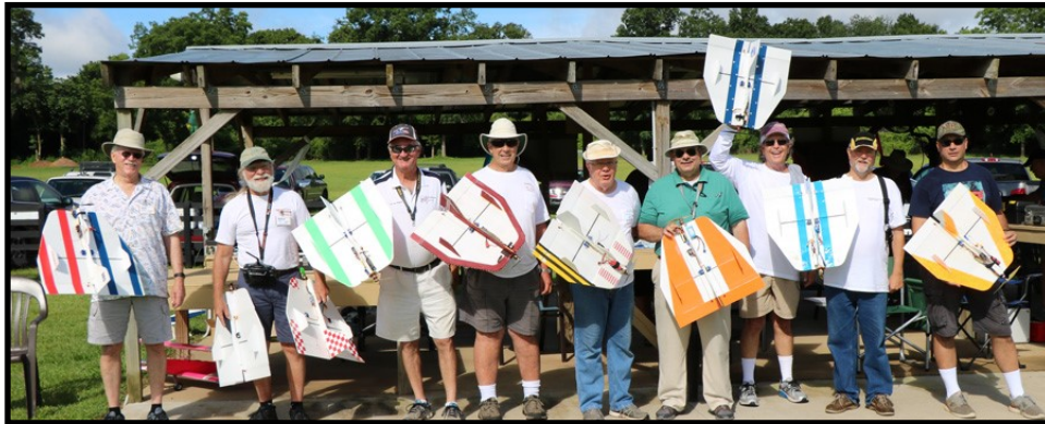
Eager competitors ready for the first club pancake race event

Wow! The past few weeks have been very busy with the Memorial Day Weekend Warbird Fly-In, hosting Sheriff's Office families and the Pancake Breakfast and Race event. And, there is more to come. . . The Firecracker Fly-in including the second round of pancake racing and the President's Barbecue and Night Fly.