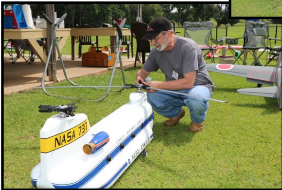
One of the beautiful scale aircraft that flew