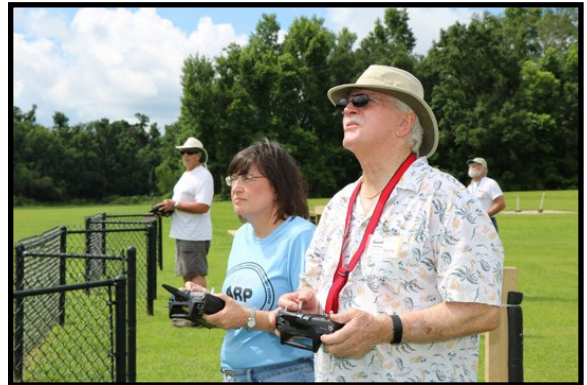
Practice, practice, practice