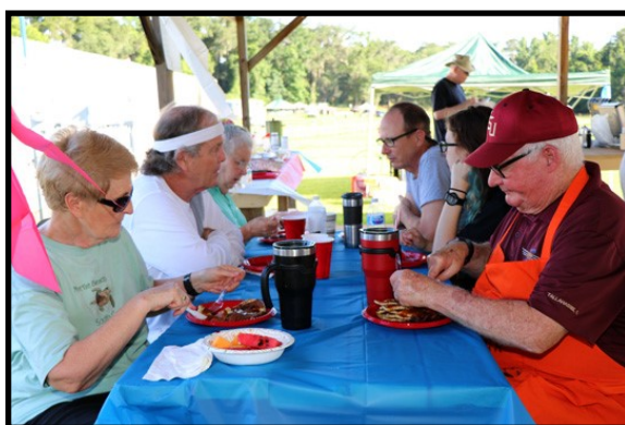
Fruits of their labor