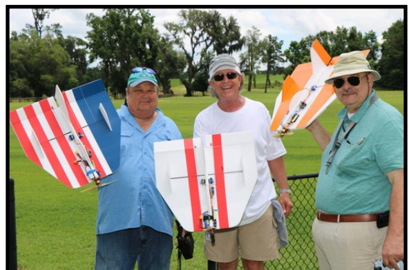
Ready for practice runs