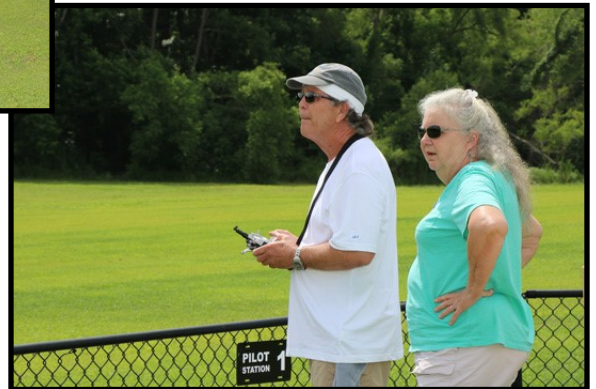
Our president and his copilot