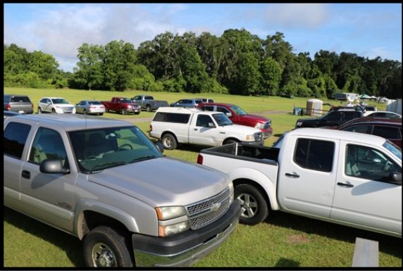
The parking lot was crowded. There was outstanding attendance.