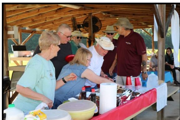
Time to eat