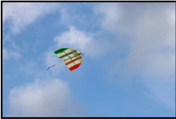
Geoff's racer zooms past