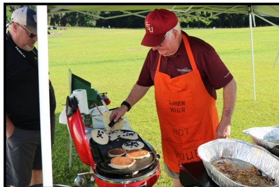
Blueberry pancakes! Yum!!