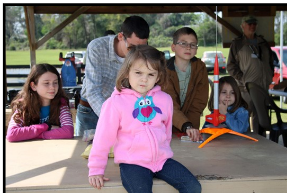
I’m getting the suspicious look