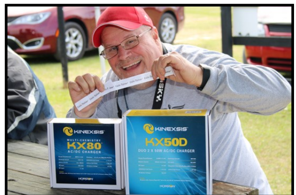
Another happy winner