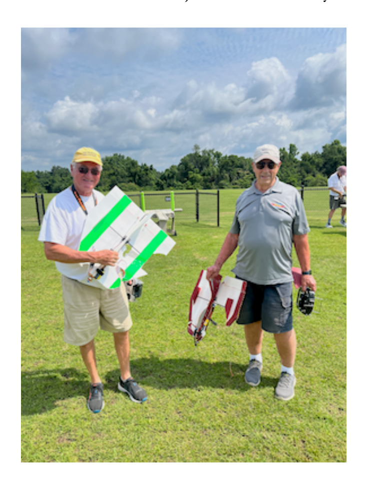
The midair remains!