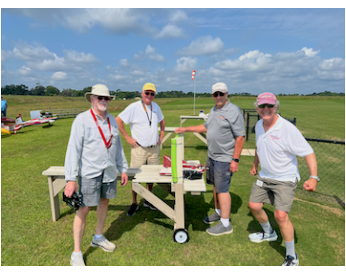
Our four intrepid Ultimate Combat pilots!