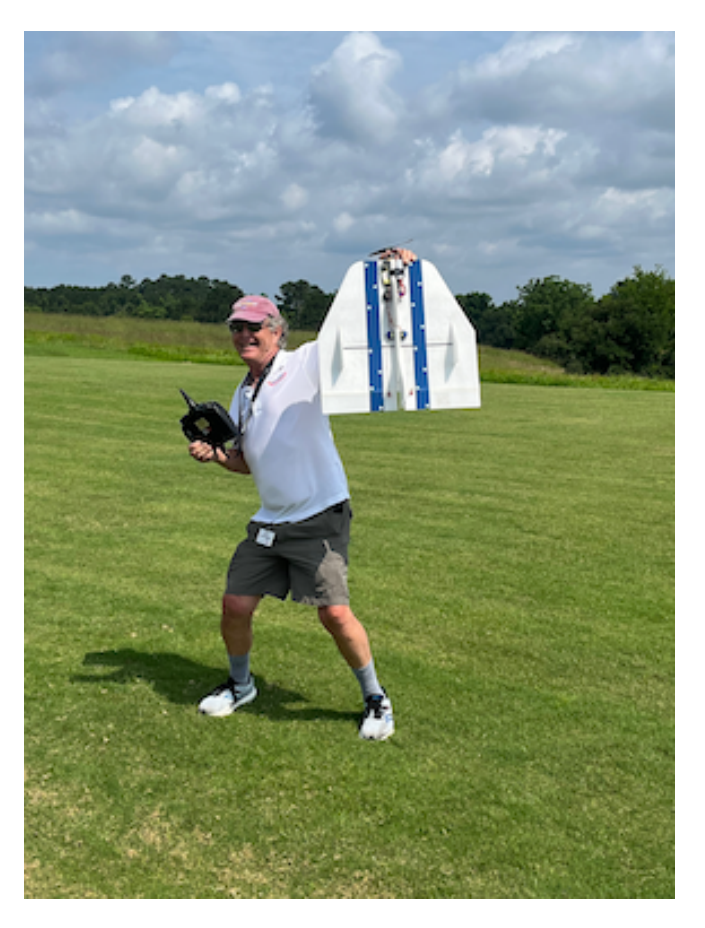
The Ultimate Combat victor!