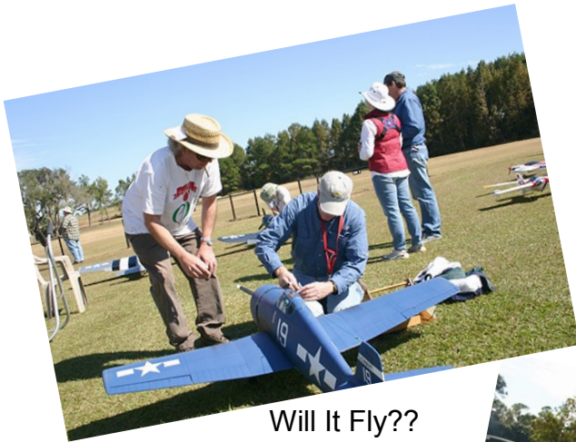
Will It Fly??