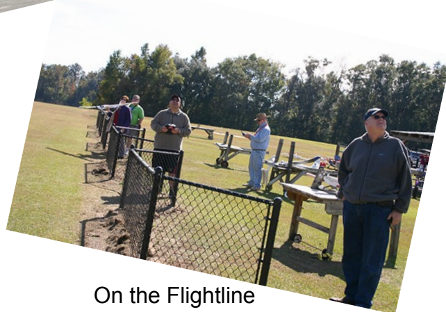
On the Flightline

Around the Field is a monthly collection of member items and activities. Feel free to email photos and comments for publication to SeminoleRadioControlClub@gmail.com