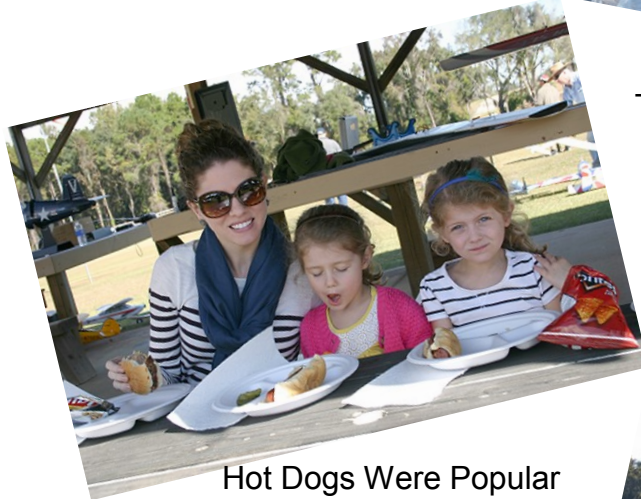
Hot Dogs Were Popular