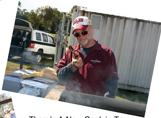
There's A New Cook in Town