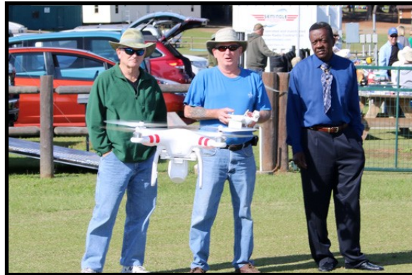
The Drones are coming!!