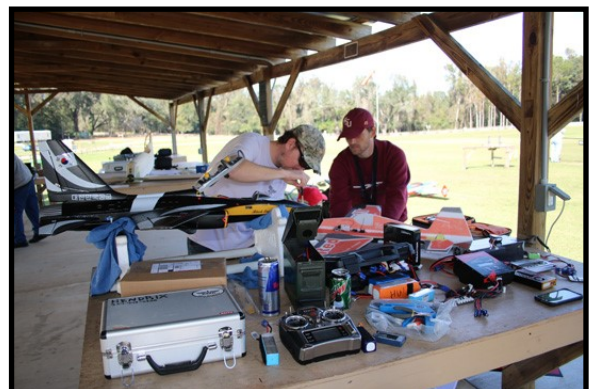
A serious workbench