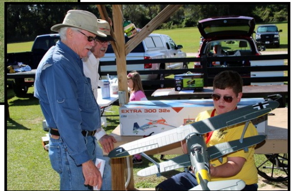
Marshal's new airplane