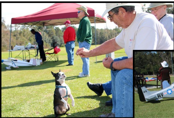
Doggone it, give it here!