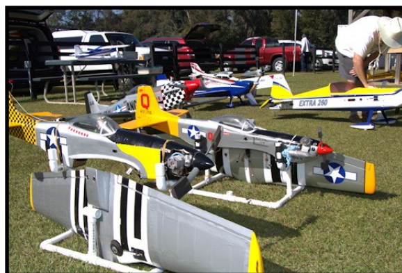
Is this before or after?