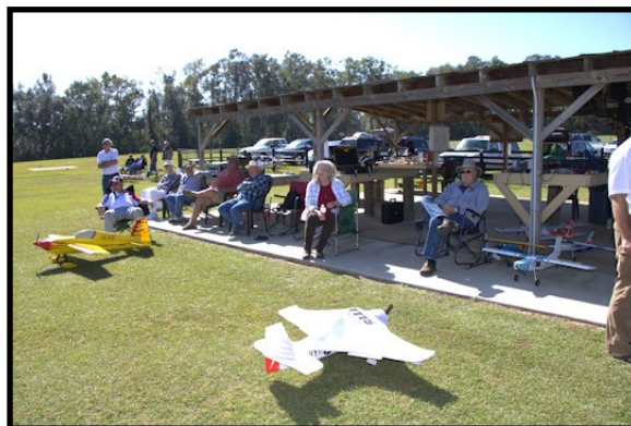
Enjoying the flying action