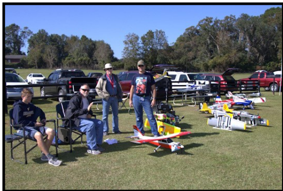
Enjoying the day and fellowship