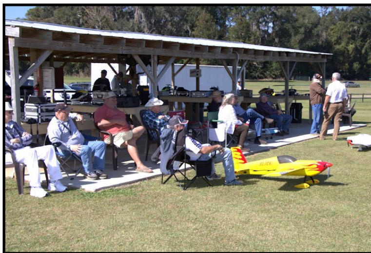
Members and friends enjoying the Veterans Day event

It was a beautiful day for our annual Veterans Day event. The field and our facilities were in perfect condition. There were a variety of models on hand and members and guests had a great time.