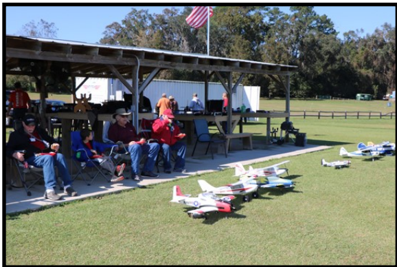
Friends enjoying the day