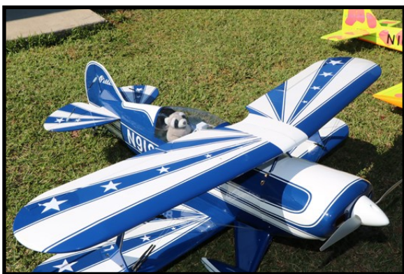
Rhett's new Pitts with Chaoui (Cajun for raccoon) at the controls