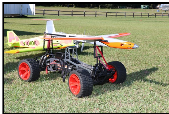
Another of Robin's launch devices. An RC car.