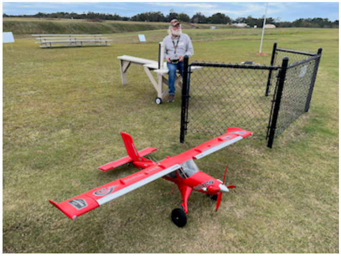
The wind was blowing pretty hard, but you wouldn't know it from these two relaxed flyers!