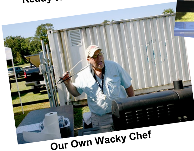
Our Own Wacky Chef

Around the Field is a monthly collection of member items and activities. Feel free to email photos and comments for publication to SeminoleRadioControlClub@gmail.com