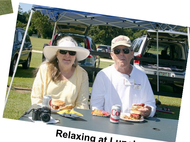
Relaxing at Lunch