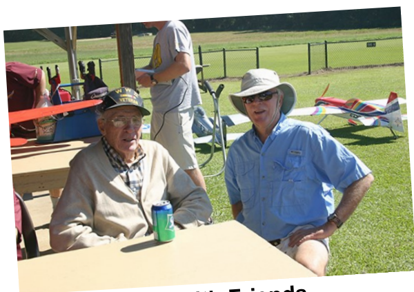
Time with Friends