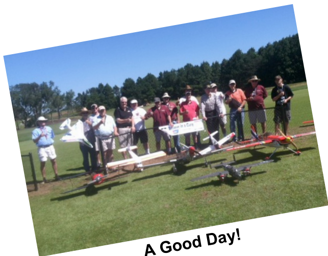
A Good Day!