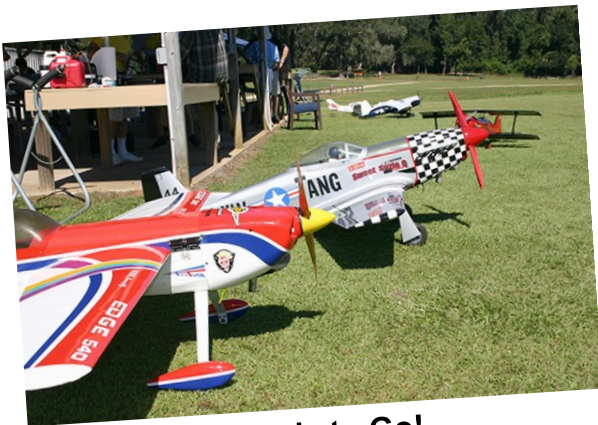
Ready to Go!