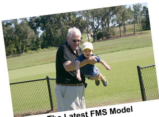
The Latest FMS Model