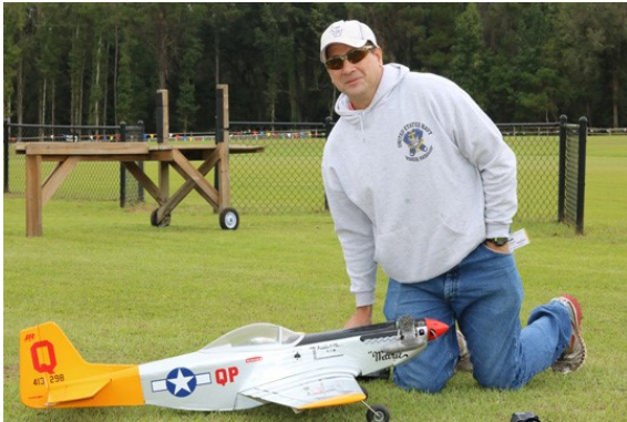
Ready to Go!