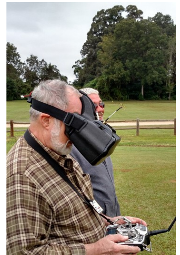
Who's that wearing a feed bag?