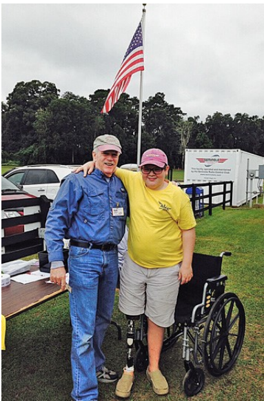
Good to see Marshal again