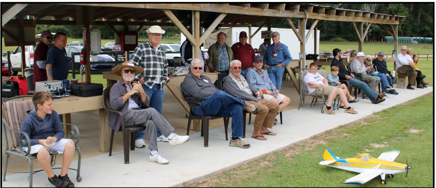
Event participants and spectators enjoy the day on our new patio