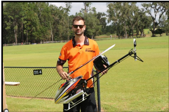
Another exciting flight complete