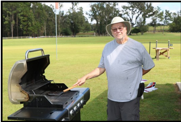
Our master chef