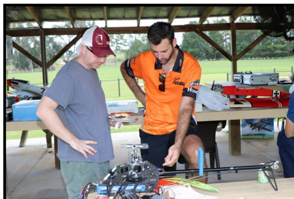
What are these leftover parts?