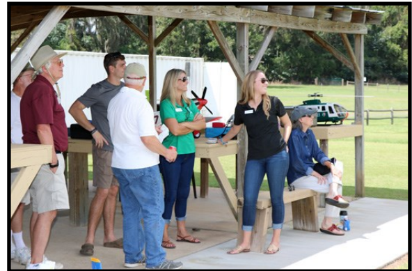
Enjoying the flying action