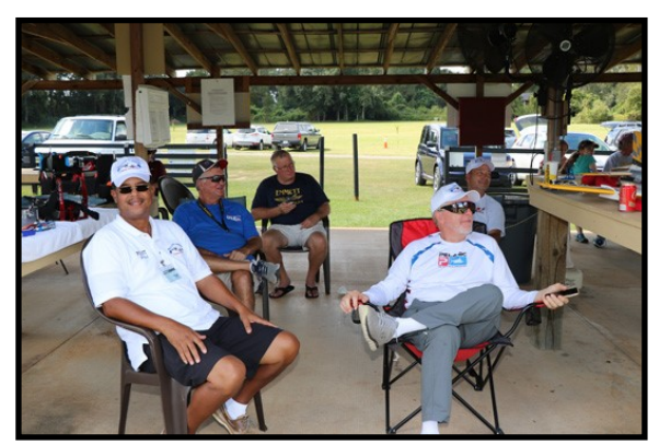
Enjoying time with our friends from Panama City