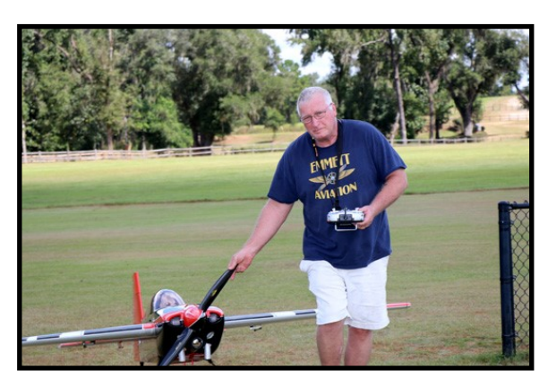
Troy after another inspiring flight