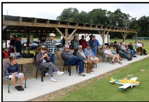
2015 Believe in a Cure Event Spectators

The Seminole Radio Control Club has a long history of giving to our community. One special event is held each fall to benefit a charity close to our members' hearts and our community. This event is Believe in a Cure and will be held on Sunday, October 9. Please note that this is a new date. The event was originally planned for a week earlier.