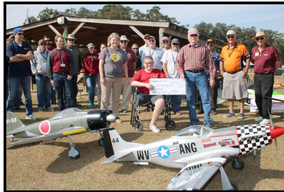
2016 check for Shands Children's Hospital

Children's Miracle Network Hospitals® raise funds for 170 children's hospitals across North America, which, in