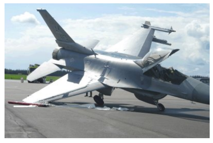
Watch those sharp left turns!