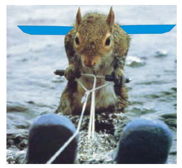
Hang in there and stay cool. Try Float Flying.